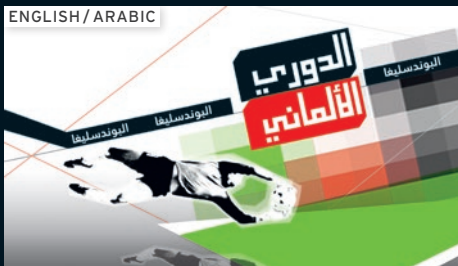
Kick off! / الدوري الألماني

Video Journalists on Location DW's Journal reporters have cameras on hand to keep viewers on top of major events and daily life. They get close to the action to show how Germany, Europe and the world are changing.