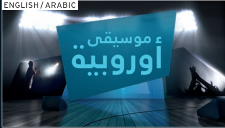
Europe in Concert / موسيقى أوروبية