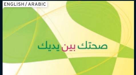
In Good Shape / صحتك بين يديك

The Globalization Program The magazine looks at the issues moving us today. Global 3000 gives globalization a face and shows how people are coping with the opportunities and risks they confront in a rapidly changing world.