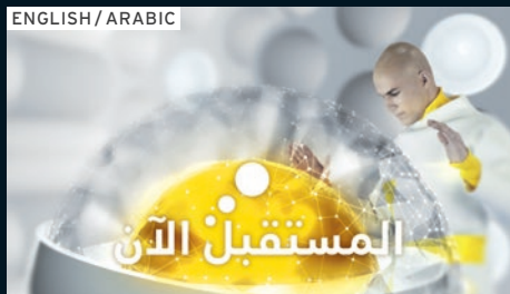
Tomorrow Today / المستقبل الآن

A spotlight on the Arab revolutions – inviting a new generation to get involved in politics and help shape history. Tim Sebastian asks the vital questions and insists on the answers.