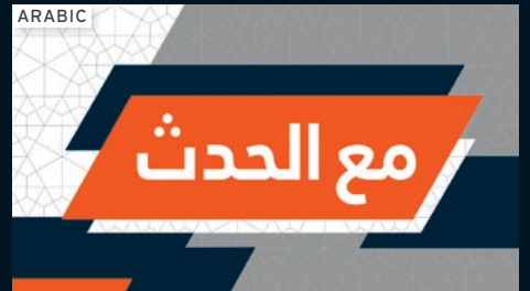
On the Pulse / مع الحدث