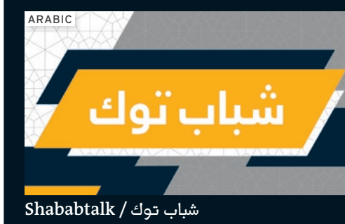
Shababtalk / شباب توك