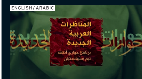
The New Arab Debates / المناظرات العربية الجديدة

An entertaining and enlightening look at Germans – Talking Germany tries to discover what makes Germans tick and how they tackle their lives in the 21st Century.