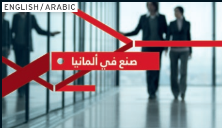
Made in Germany / صنع في ألمانيا