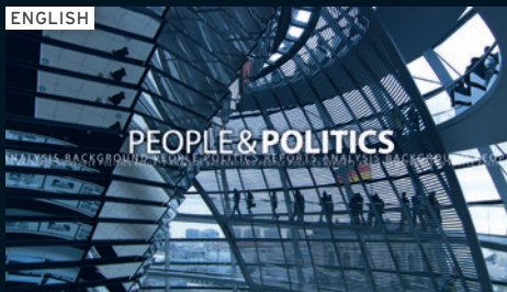
People and Politics

The Bundesliga Preview Kick off! Countdown is your weekly dose of action and news from Germany's top soccer league. All the stats and insider information you'll need to know to enjoy the upcoming round of Bundesliga play.