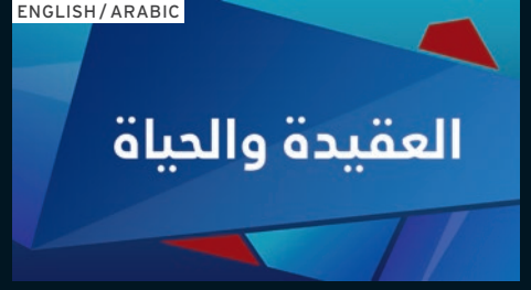
Faith Matters / العقيدة والحياة