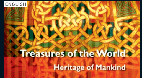
Treasures of the World

Developments and trends in research: From space travel to environmental conservation, from genetic engineering to medical innovations, Tomorrow Today has the scoop on science.