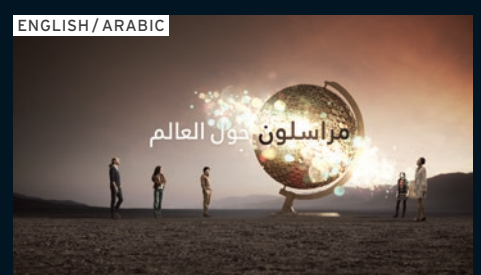
World Stories / مراسلون حول العالم

Extraordinary architecture, amazing industrial memorials and fascinating natural landscapes are recognized by UNESCO around the world. Each is unique and authentic, with its own story to tell.