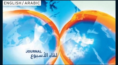
Journal Interview / لقاء الأسبوع