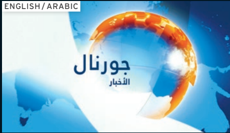
Journal / الجورنال