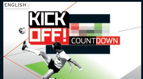
Kick off! Countdown

The Bundesliga Highlights All the top matches, goals, highlights: the best of the Bundesliga – Germany's premier league – in compact, concise coverage.